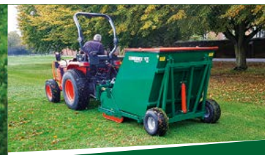
STC SCARIFIER COLLECTOR