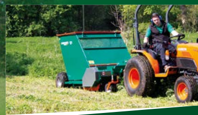
STC FLAIL COLLECTOR