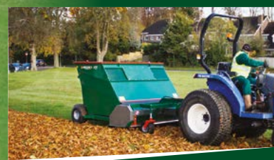
STC SWEEPER COLLECTOR