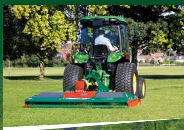
RIGID DECK RMX-240