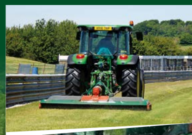
RIGID DECK RMX-300