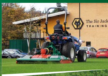
RIGID DECK RMX-180